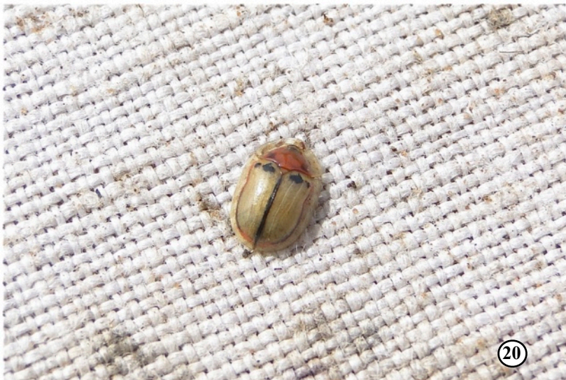
Fig. 12-20. - Aspidimorpha rainoni n. sp., paratypes.